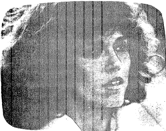
Jane Fonda in "Coming Home"

This conduct I felt was destructive of the democratic process and was utterly inconsistent with the principles of a free society.