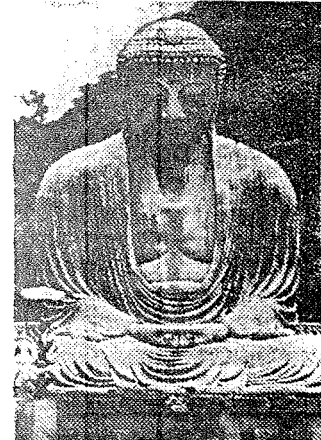
Buddhist shrine at Kamakura

Act of charity, righteous life, From all alarms the kin protecting, Blameless pursuits fully rife; This, the Highest Blessing."